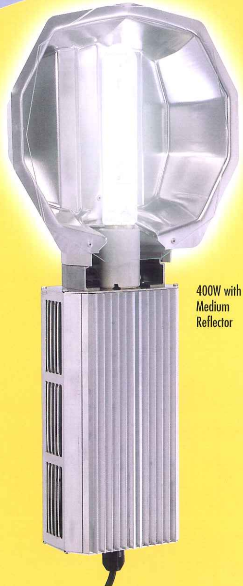
400W with Medium Reflector