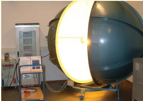
The Ulbrich Sphere can test the lumen/PAR light output of any bulb.

FOR THE LONG-TERM MAINTENANCE OF YOUR LIGHTING SYSTEM